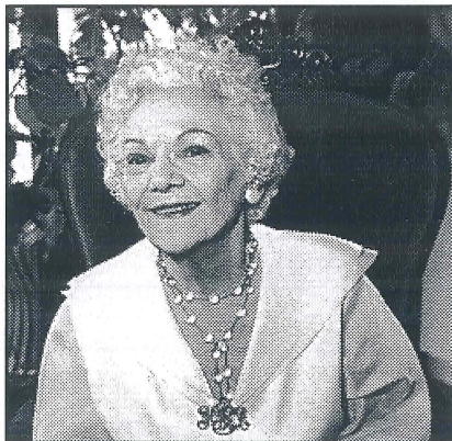
KAP in her Westchester Park apartment, College Park, MD, 1975.