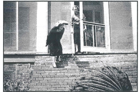
KAP and Flannery O'Connor at O'Connor's home, 1965

invited her first for a religious event, because you know she was raised a Catholic, and we appealed